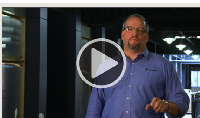
Understanding Device Ruggedness

Because downtime is so expensive, there is clear value to keeping these devices functional. Ruggedness is a requirement, not an option, when working extensively outside office and home environments. In the real world, mobile phones will be dropped onto concrete, and they will be rained on. That doesn't mean the phone will stop working. There are product features that protect phones – and preserve productivity – in very challenging environments. The following sections explain how specific features and product characteristics impact reliability in non-office environments.